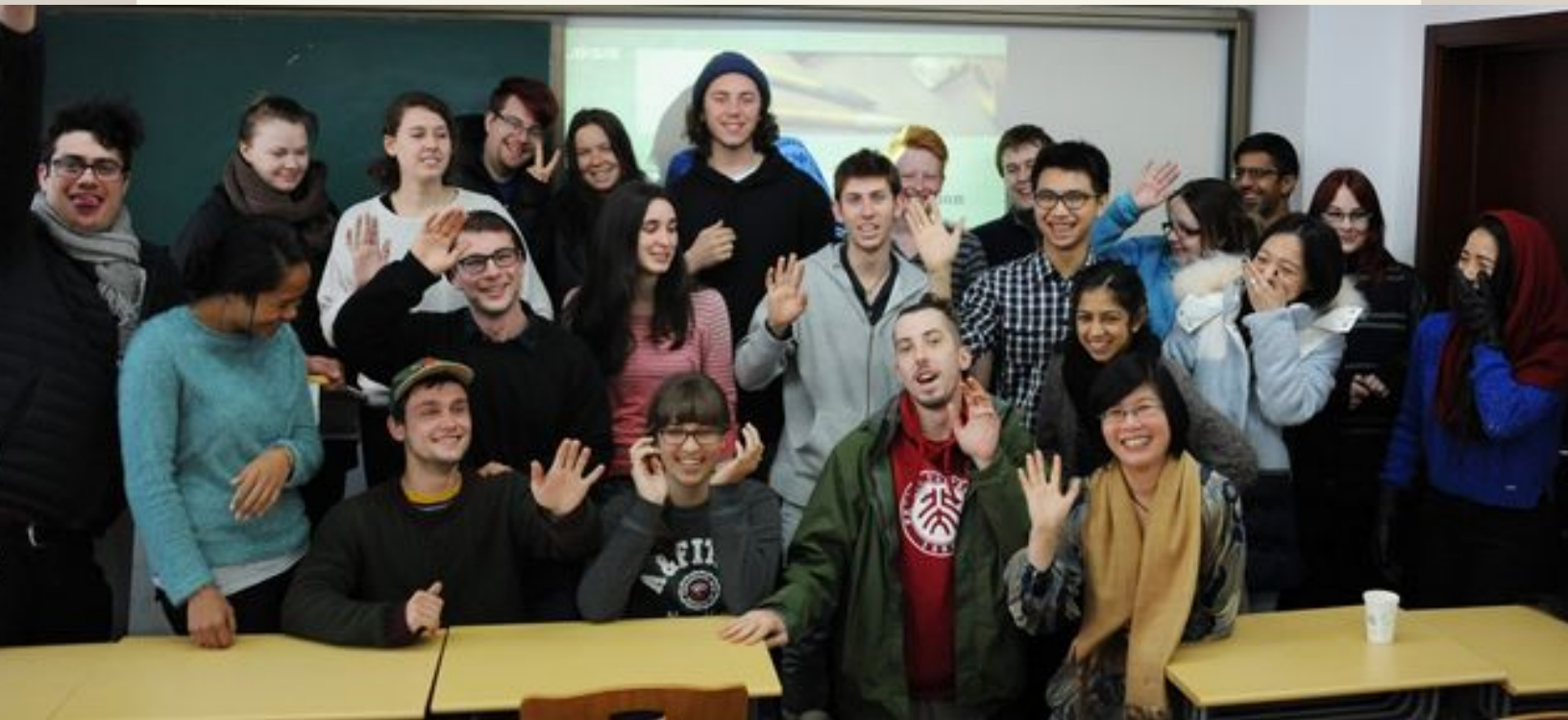
中国政法大学港澳台教育中心 Education Center of Hong Kong, Macau and Taiwan Students, CUPL