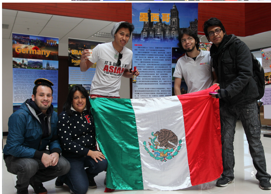
1, A group photo of students and teachers